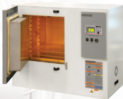
RFD1-42 benchtop oven

*50 hertz electrical is available on all models