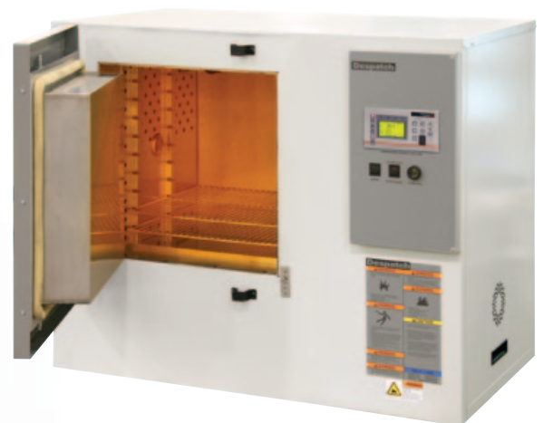
RAD1-42 benchtop oven

*50 hertz electrical is available on all models